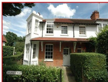
Sold - Brunner Road

If you are considering a sale, contact Derek Grimshaw FRICS to arrange a free, no obligation market appraisal of your property.