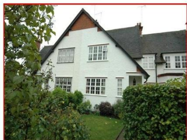
Sold - Meadvale Road

Leading independent Estate Agents, successfully selling Brentham properties for over 49 years