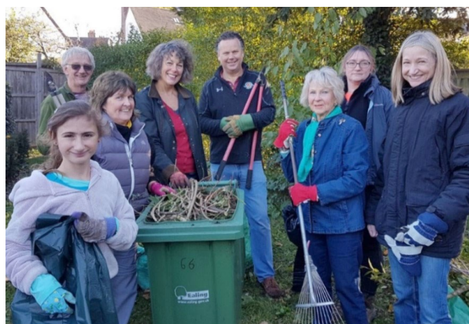
Volunteers tackle the twitten