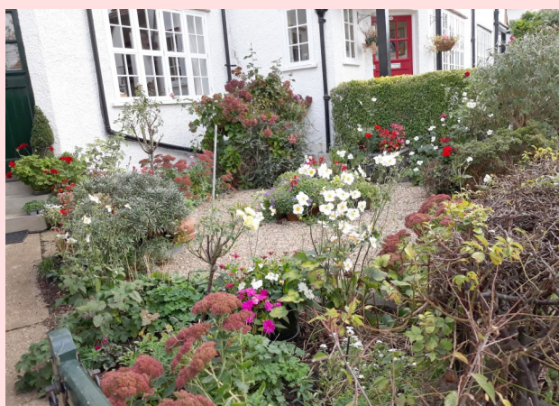
Autumn Garden Winner - 26 Ludlow Road

It was a pleasure to see this lovely, serene garden curving round her house during the heatwave in the summer. White and blue hydrangeas, white roses and clematis gave a sense of coolness in the heat of the day. The combination of leaf shapes, the variety of shrubs, including cloud pruning and perennials, is exquisite and shows a real artist at work.