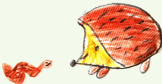
Drawing by Ellie Golding (aged 6)