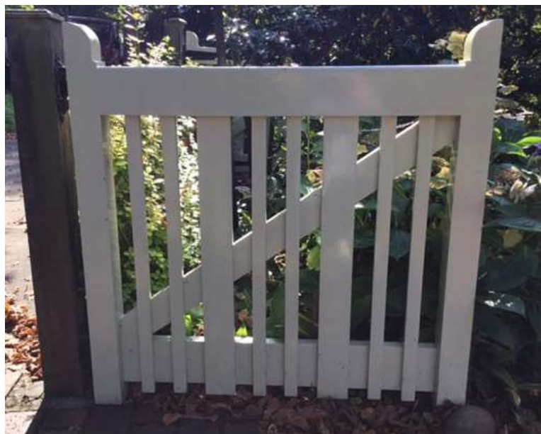
Figure 1: Most common timber gate